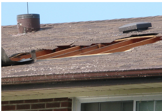
Roof sheathing must be securely fastened to prevent wind damage.

Choose a high-wind rated roof cover and make sure ridge and off-ridge vents are also rated for high winds. If a homeowner is not ready to re-roof, check vents to be sure they will stay in place and are of the proper type and strength to resist high winds and wind-driven rain.