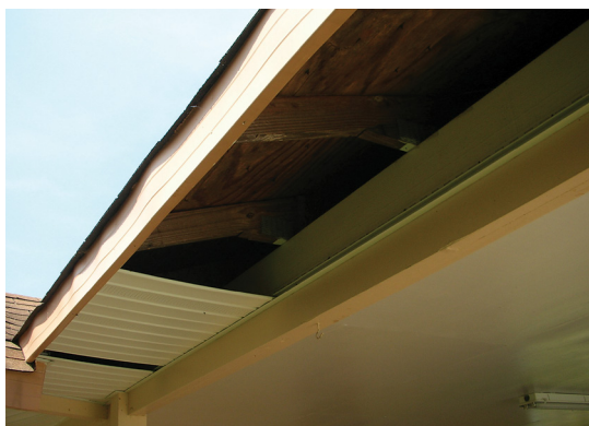
During a storm, the eaves of a home can expose the structure to the ravages of wind-driven rain.

During a storm, the eaves of a home can expose the structure to the ravages of wind-driven rain on two fronts. The most obvious danger comes when soffits are blown out during a storm. Water intrusion can also occur when strong winds drive water through vented soffits. Homeowners should check the condition of their soffit covers