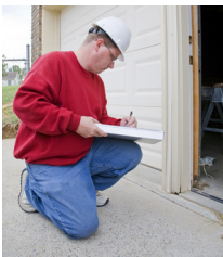
Home inspectors can help assess a home's capacity to withstand storm-force winds.

Because each home is different, building inspectors can offer important insights into your home's capacity to withstand storm-force winds. Inspectors can provide important information on the age of your home, and its capacity to resist extreme winds. Contacting your municipality is the easiest way to find a good home inspector with knowledge on your area.