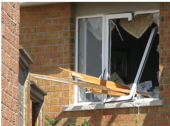
Flying debris from severe winds can easily penetrate unprotected windows.

Although tornadoes and severe winds can exert tremendous pressure against homes, a significant portion of property damage is not from the wind itself but from airborne materials. Items such as tree limbs and branches, signs and sign posts, roof tiles and shingles, metal siding and other pieces of buildings (including entire roofs in major storms) can easily penetrate unprotected windows and sliding doors. This wind-borne debris can cause significant damage to interior walls and ceilings not designed to withstand such forces. As well, wind penetration results in the uncontrolled build-up of internal air pressure which can weaken the structure.