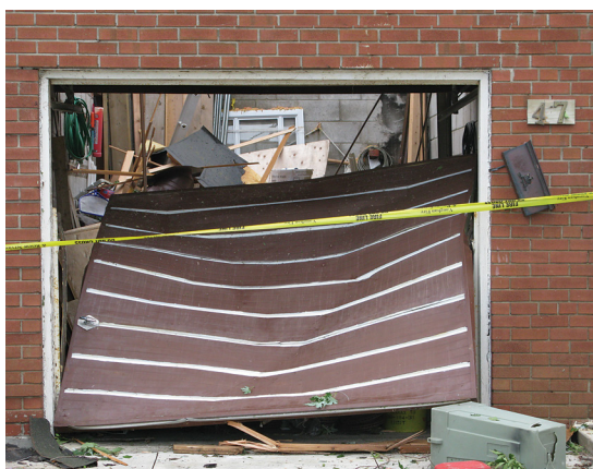
Garage doors can be the weakest opening of a home in a severe wind storm.