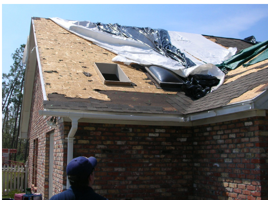
High winds are a major cause of roof damage.