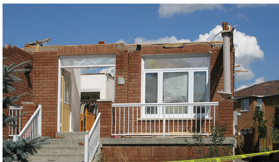
Roof uplift and failure is a common source of damage linked with high winds and tornadoes.

Strengthen the fastening of the roof sheathing to the roof structure and